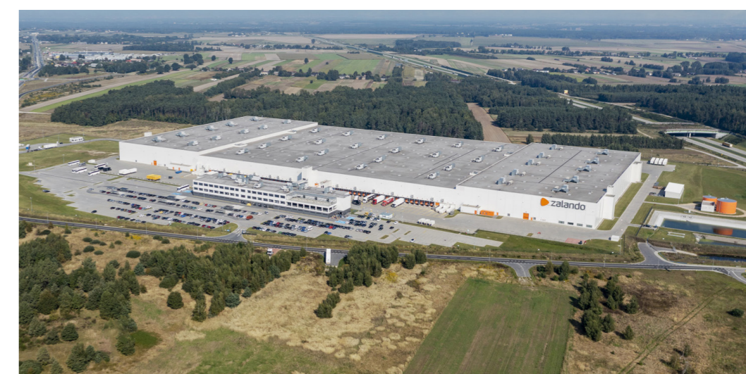
▼ Located in the central part of Poland, Zalando Gluchow has a net lettable area of 125,460 sqm, and is well-positioned within a recognised prime industrial area.

MUSEL’s performance to date illustrates Mapletree’s disciplined strategy of investing in quality logistics assets, unlocking value through active asset management. We remain committed to delivering double-digit IRR to our investors.