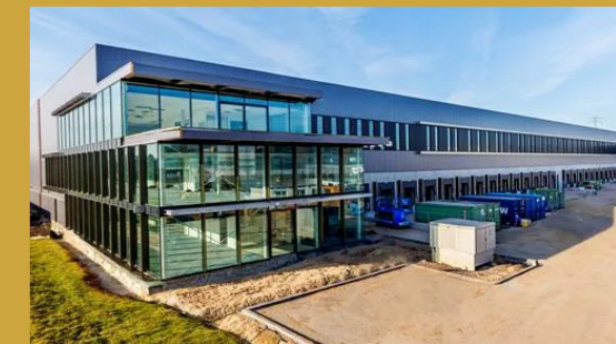
▼ Park 15 is part of Mapletree's growing logistics presence in Europe.

The acquisition adds to Mapletree's growing logistics presence in the Netherlands, following the Group's purchase of a logistics facility in Roosendaal in December 2025. Since entering the European logistics market in 2018, the Group now has 83 logistics assets worth about EUR1.6 billion in assets under management across eight countries.