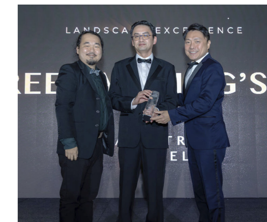
▲ Among The Reef at King's Dock's recent accolades is the Land Excellence award at the EdgeProp Singapore Excellence Awards 2025.