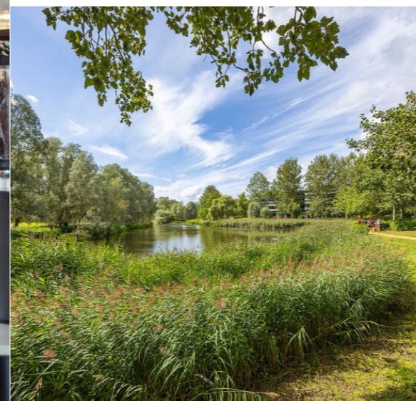
▲ Green Park is home to not just businesses, but bats, bees and birds.

An example is how little access holes were added to new fencing to help critters move freely and safely across the site. The park also buzzes with activity through bat training sessions and beekeeping courses, where tenants learn directly from experts about the biodiversity around them. Together, these initiatives position Green Park as a model of how sustainable practices can co-exist with businesses for the long term.