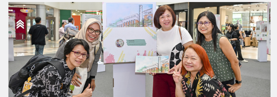
▲ Five artists pose with their sketches, which were put on display during an urban sketching exhibition organised by Mapletree and local art community Urban Sketchers Singapore.