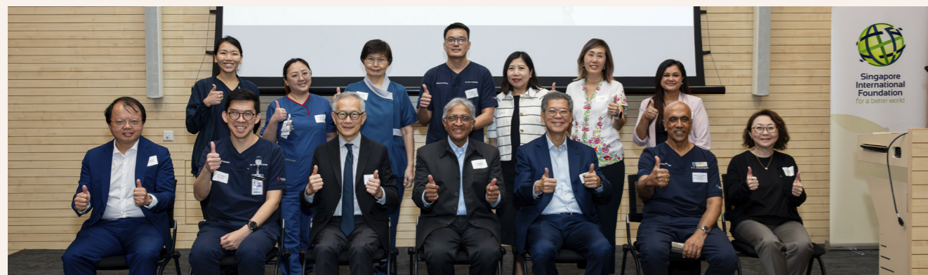
▲ Held on 14 November 2025 at Tan Tock Seng Hospital, the Mapletree Community Impact Programme Appreciation Ceremony was attended by representatives from SIF, Mapletree Investments and SIV.