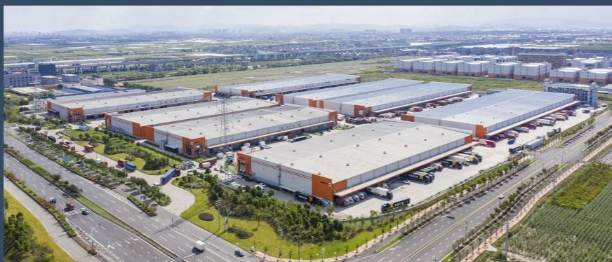
▲ Mapletree (Yuyao) Industrial Park Phase I and Phase II consist of eight single-storey warehouses, strategically located between Ningbo and Hangzhou, two major cities in the Yangtze River Delta, and connected to multiple highways.

The annual list is based on research by Guandian Organisation, a real estate news agency in China. Mapletree owns over 140 logistics assets across more than 70 cities in Mainland China, with its global logistics portfolio spanning 12 key markets worldwide.