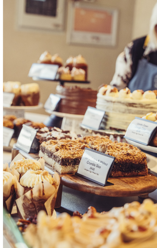
▲ The Street Bakeshop at Green Park offers everything from sourdough to savoury sausage rolls, all crafted fresh.