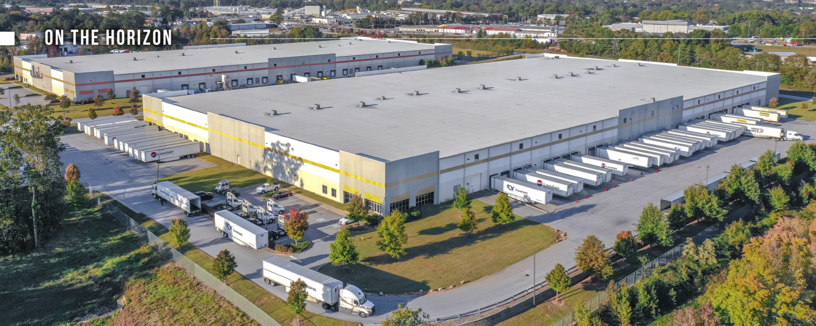
▲ The divested assets under MUSEL include 2721 White Horse Road in Greenville, South Carolina.