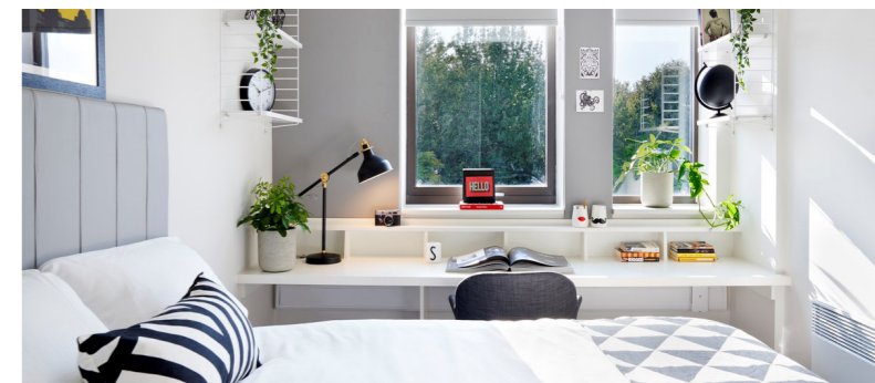
The development offers a peaceful environment for study and rest.

The development’s exterior further builds on this sustainable approach. Its facade is created from Building Research Establishment Environmental Assessment Method (BREEAM) A+-rated, glass-reinforced concrete panels. BREEAM is a sustainability rating system used widely in the UK to evaluate buildings’ environmental performance.