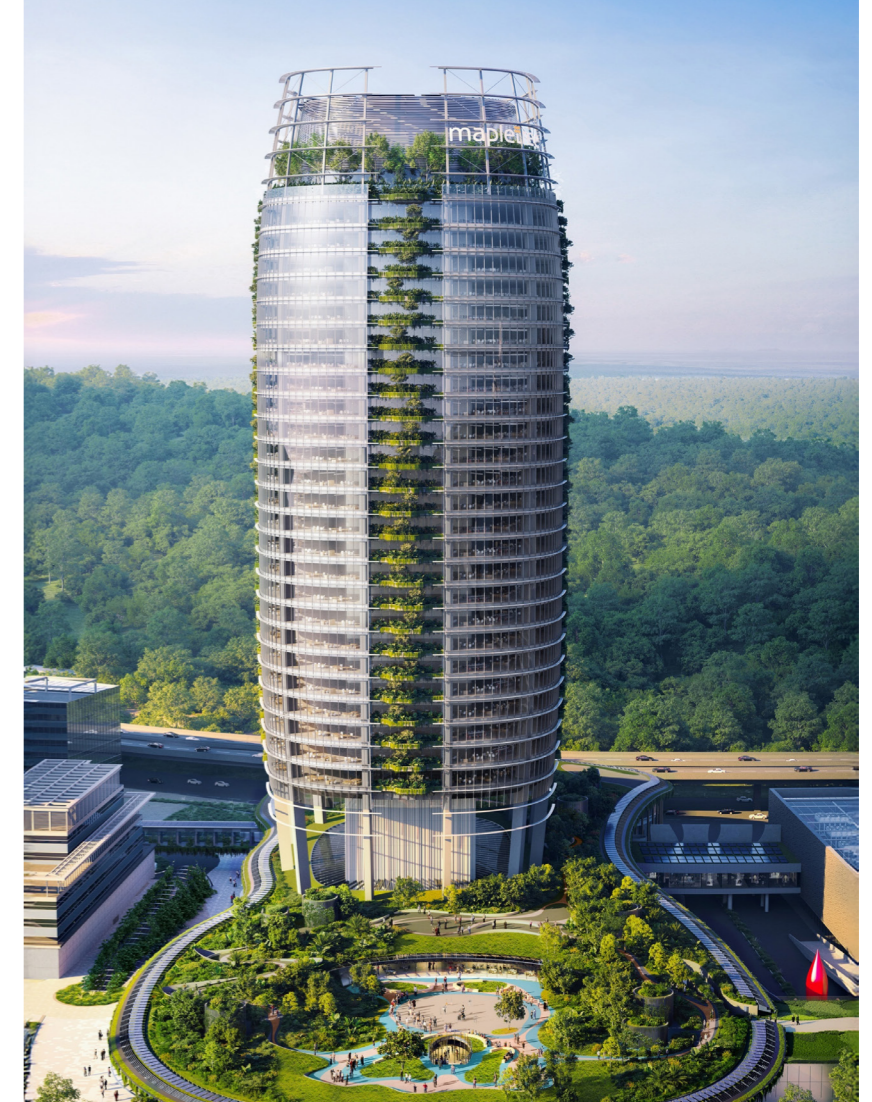
▲ Artist's impression of the transformed HarbourFront Centre, expected to be completed by 1H 2031.

Strategically positioned between VivoCity and HarbourFront Towers One and Two, it offers direct access to HarbourFront MRT station.