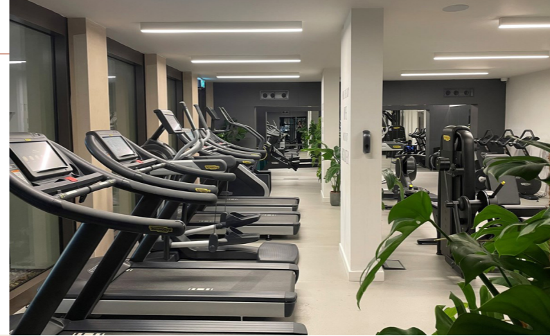
Among the facilities is a 24/7 gym.

It is part of Mapletree’s growing global student housing portfolio, a key focus area in the company’s long-term investment and diversification strategy. Since entering the student housing sector in 2016, Mapletree has built a portfolio of 25,900 beds across 77 properties in 41 cities worldwide. In the United Kingdom (UK), Mapletree is the fourth-largest student housing owner, with other Student Castle properties in Cambridge, Edinburgh, York and more.