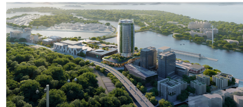
▲ The reimagined HarbourFront Centre will redefine Singapore's southern skyline.

The development features a 13,000 sqm elevated park with cascading greenery, adjacent to a waterfront promenade offering views of the Singapore Strait.